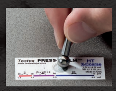
For use with Testex™ Press-0-Film™ Replica Tape

Measures and records surface profile parameters using replica tape